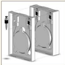
STOCK FIBER COIL PACK

TEST REPORTS AVAILABLE AT WWW.TEMPO-FOAM.COM FOR ORGANIC ANALYSIS AND LIQUID PARTICLE COUNTS