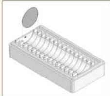
STOCK PACKAGE FOR ROUND SUBSTRATES

OUR COPOLYMER FOAMS ARE CLEANROOM COMPATIBLE!